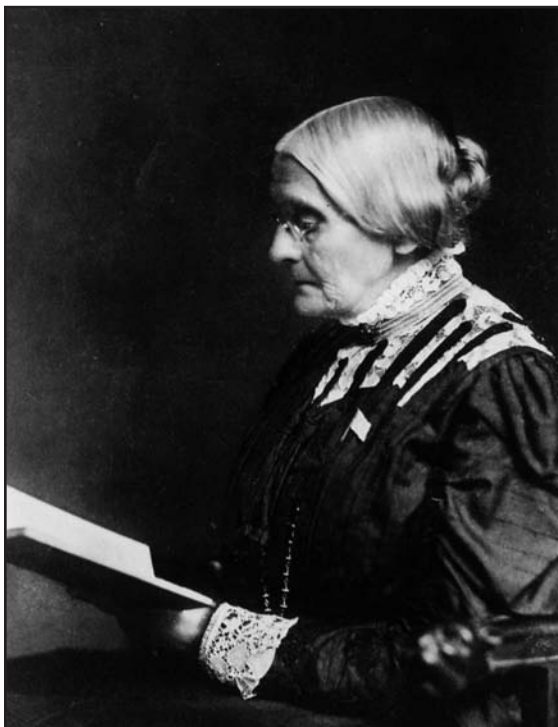
Early leaders in the movement for women's rights found an audience in Elgin. Susan B. Anthony came to lecture on women's right to vote in 1876.