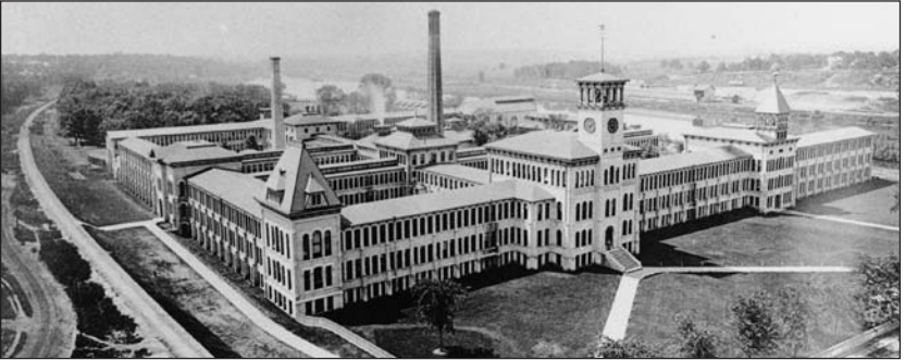
The watch factory as it appeared in 1887. In 1925, when the Elgin National Watch Company’s output was nearing its production peak, of 4,216 employees, 2,139 were female.

in the crowd and be trampled upon before they were picked up again and placed in the moving stream.” To remedy this situation, women employees were allowed to quit work at four minutes to twelve o’clock and four minutes to five o’clock.