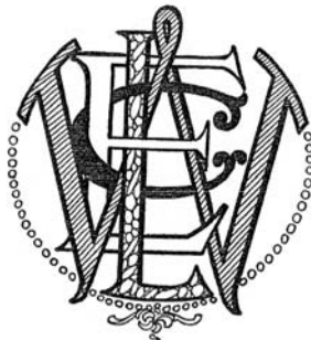
Insignia of the Everyday Wednesday Literary Club.

Daughters followed mothers into the Club, and today two members have a great-great grandmother who joined back in 1881.