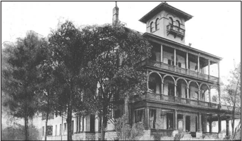
Sherman Hospital as it appeared about 1895.