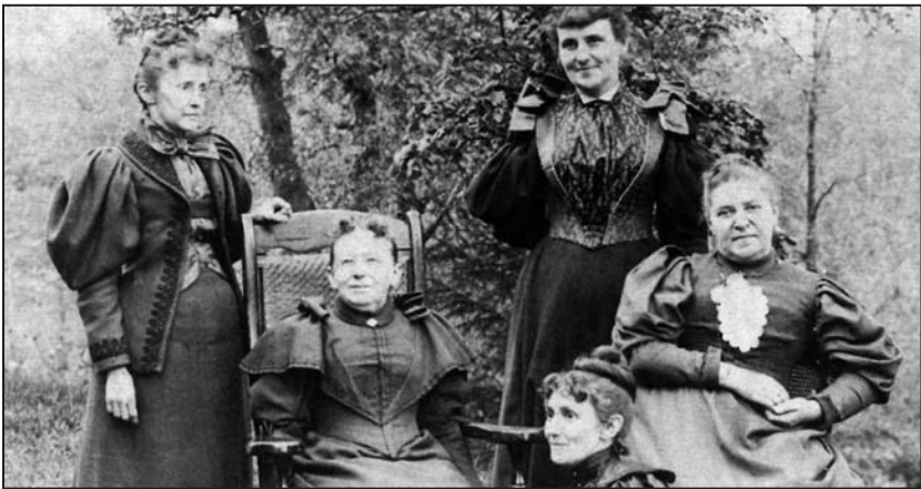
Photograph of the Perry Literary Circle members in 1895.

Attempt the end And never stand to doubt. Nothing's so hard, But search will find it out.