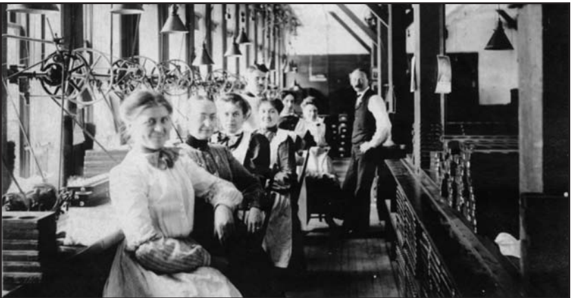
In the nineteenth century women worked at the watch factory benches for six ten-hour days each week, and holidays were infrequent.