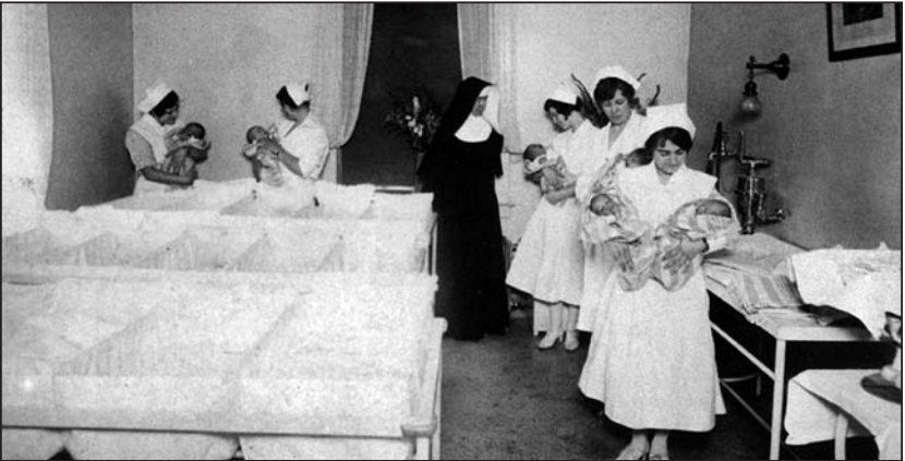
St. Joseph Hospital's nursery about 1928.

Today women staff members are in the majority at Elgin's largest employing business firms and non-profits. They outnumber men at School District U46, Chase Card Services, and the Grand Victoria Casino.