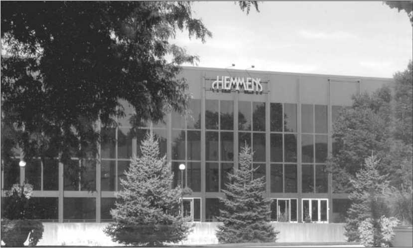
Hattie Pease Hemmens remembered Elgin in her will, bequeathing more than one million dollars for a community building. The Hemmens Theater was completed in 1969.