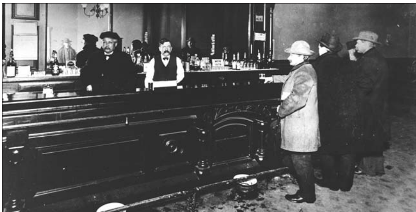
The Nick Goedert Saloon, located at 170 E. Chicago Street, was one of 34 saloons forced to close after the 1914 election.

The election closed thirty-four saloons in the city and three others elsewhere in the township, but local option did not solve the liquor problem. Adjacent townships to the north and east remained wet, and thirsts could be slaked at River Street saloons in East Dundee and border bars in Hanover. Unlicensed clubs and blind pigs sprang up and some drinking probably shifted to the home. Sometimes a crusade that attempts to resolve one problem creates others.