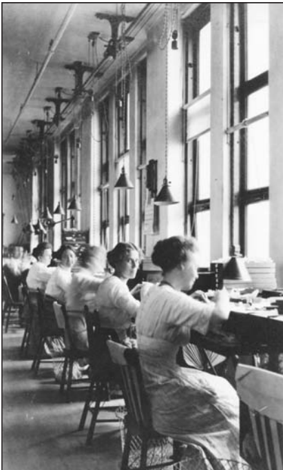
At the watch factory, women's nimble fingers were adept at operating intricate machinery and assembling minute parts. This photo was taken in the watch factory's motion room in 1912.

There were drawbacks to working at the big factory. In 1911 officials had to protect women from the noon and evening exit jams. “Squeezed in the crush, knocked against the walls and bumped hither and thither, many women are said to have sustained injuries of greater or lesser extent,” reported the weekly Advocate . “It has not been unusual for women to fall