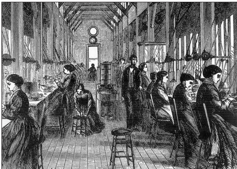
Watch factory train room, 1873, where many women were employed.