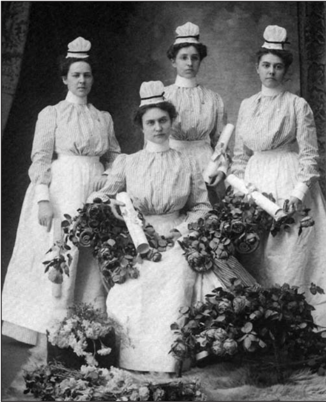
Sherman Hospital Nursing School graduates, 1904.

Women comprised about half the work force at the Elgin Mental Health Center until the First World War, when they were the majority until the 1960s. From that time on the employees were about equally divided by gender.