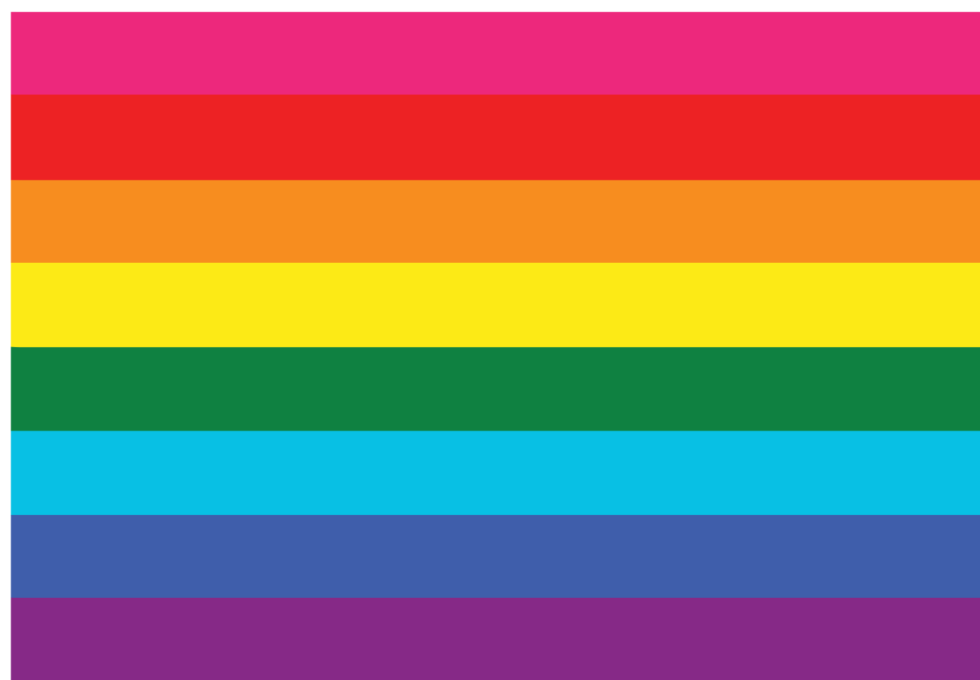
ORIGINAL GILBERT BAKER PRIDE FLAG

Represents those who don't identify as exclusively male or female.