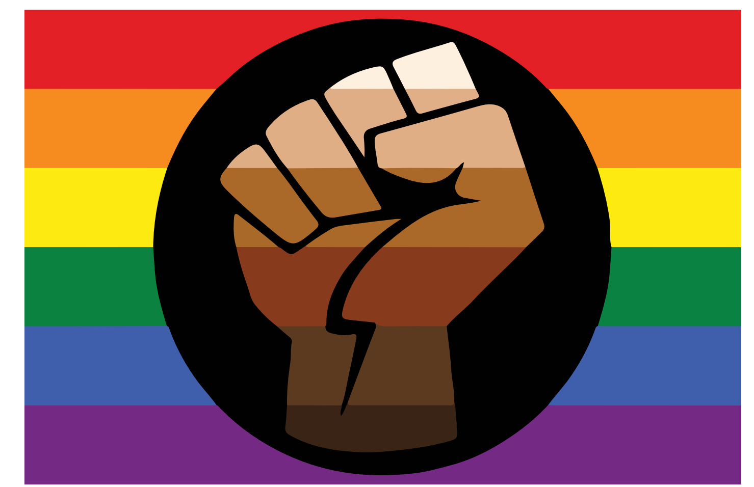
QUEER PEOPLE OF COLOR

Represents those who are attracted to many genders.