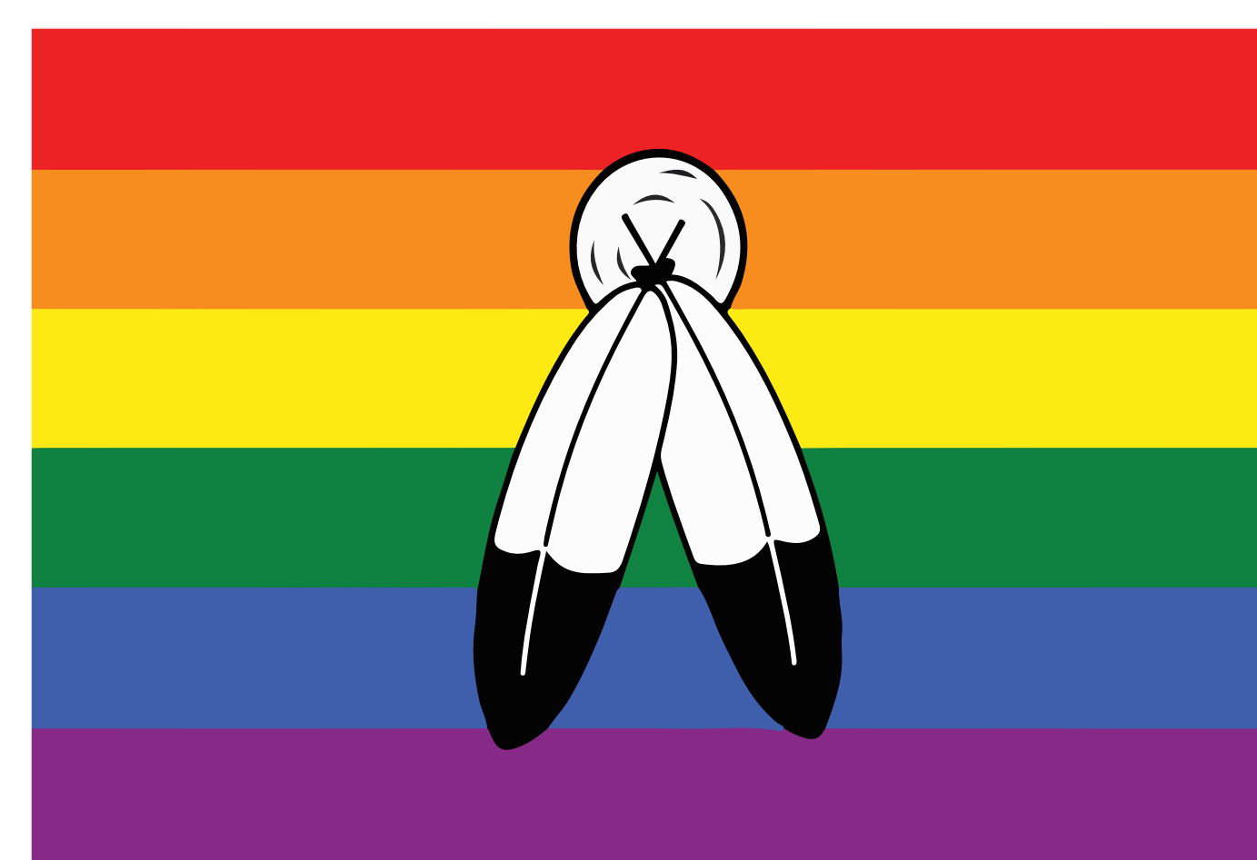
TWO - SPIRIT

Represents those whose biological sex at birth does not match their gender identity.