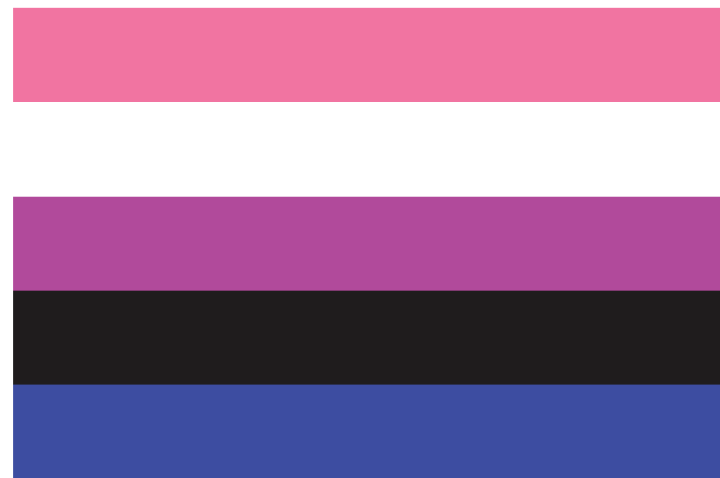
GENDER - FLUID

Represents those who require an emotional bond with another person before any sexual feelings can occur.