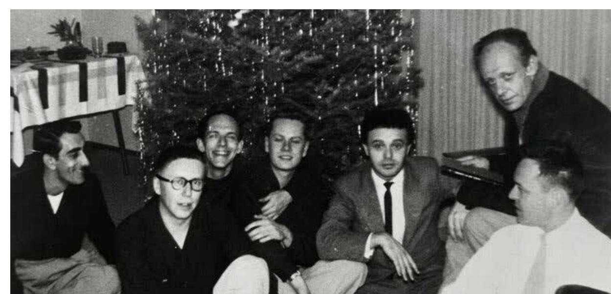
L to R: Mattachine Society Founders Paul Bernard, Chuck Rowland, Bob Hull, Stan Witt, Rudi Gernreich, Harry Hay (top), Dale Jennings.