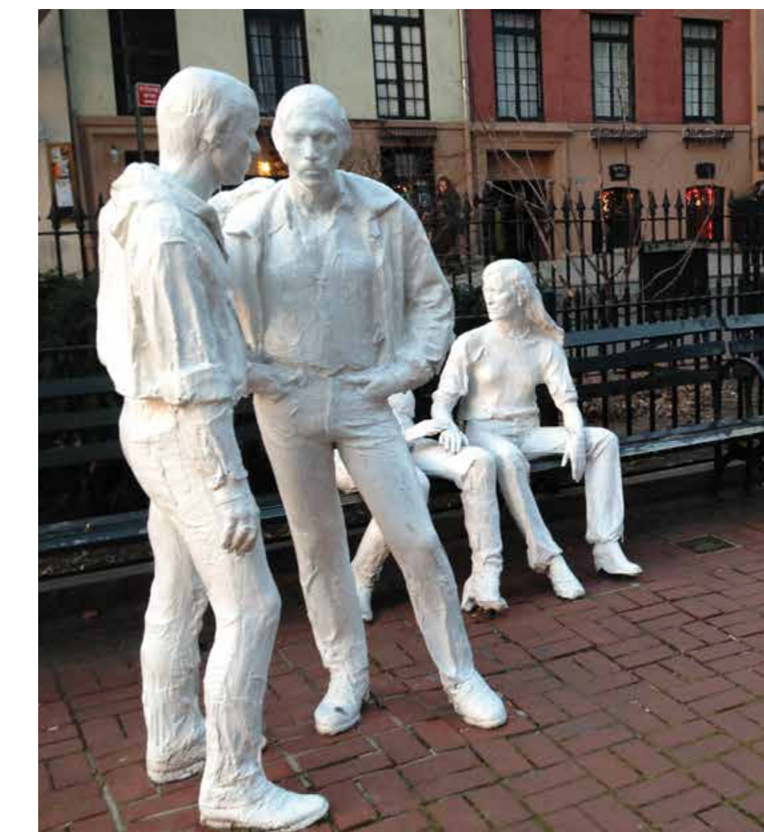
"Gay Liberation" by George Segal, Christopher Park.

President Obama announced the first national LGBTQ monument Stonewall National Monument at the Christopher Park (Central Park), The Stonewall Inn and the surrounding streets and sidewalks that were the sites of the 1969 Stonewall Uprising.