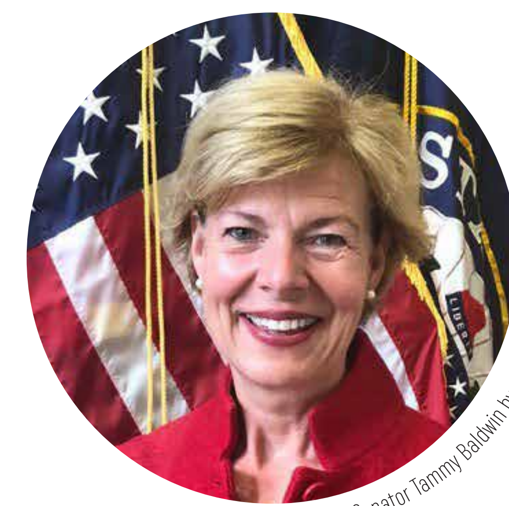
Photo: Senator Tammy Baldwin

Tammy Baldwin became the first openly gay politician and the first Wisconsin woman elected to the U.S. Senate.