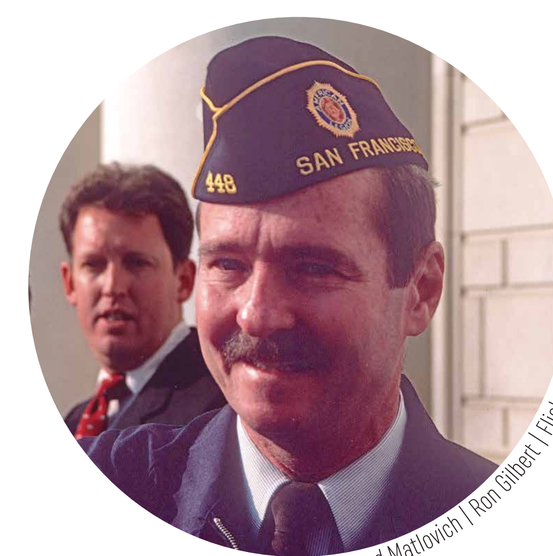
Leonard Matlovich

Tech. Sgt. Leonard Matlovich , a recipient of the Purple Heart and the Bronze Star, became the first openly gay service member of the military to fight the ban against gays. He appeared on the cover of Time magazine on September 8, 1975.