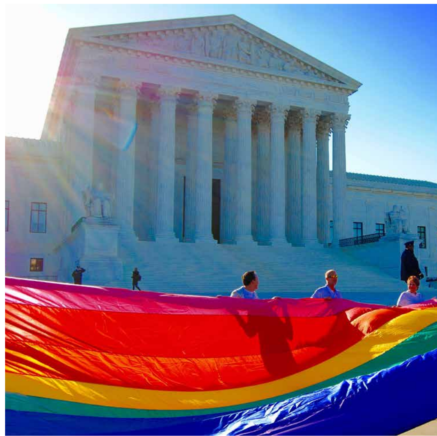
Demonstration in favour of same sex marriage about Obergefell v. Hodges in front of Supreme Court.